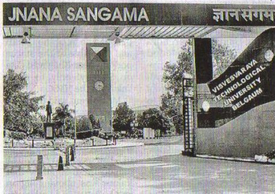
A file photo of Visvesvaraya Technological University.

Among some of the measures that will be taken for the revamp is to increase weightage for internal assessment. Currently, 20% weightage is allotted to internal assessment while the remaining is for external examination.