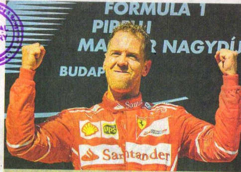
Vettel wins thriller in Hungarian GP

Mangaluru, Monday July 31, 2017 Pages 18 Vol 20 No 211 ₹6.00 M www.deccanherald.com